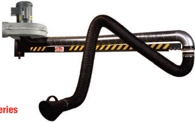
Ace® 75 Series

Contact Factory For System Design Assistance 800-949-1472