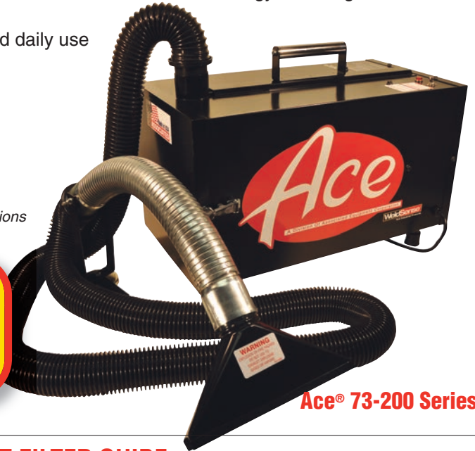
Ace® 73-200 Series

Featuring nine filtering combinations, including HEPA for Hexavalent Chromium control, and 95% (MERV 15) for carbon steel weld fumes.