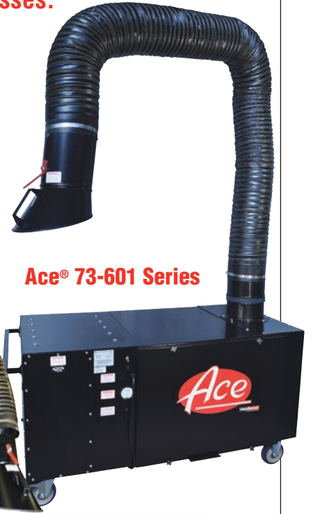
Ace® 73-601 Series

Not recommended for arc gouging or plasma cutting operations