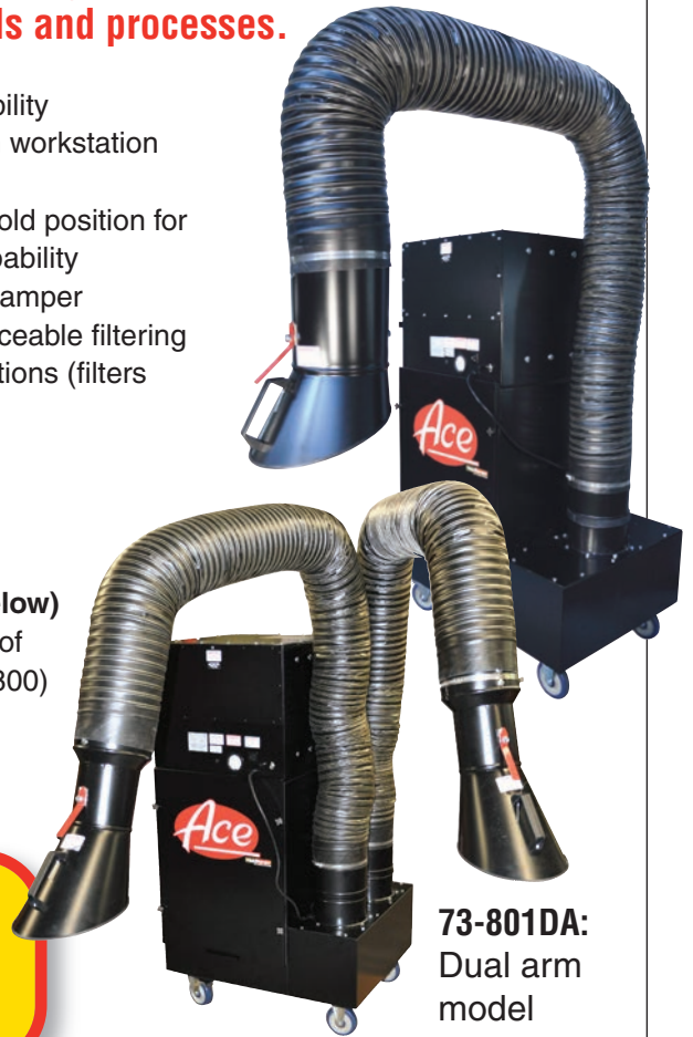
73-801DA: Dual arm model

Small footprint, designed especially for shops with limited floor space