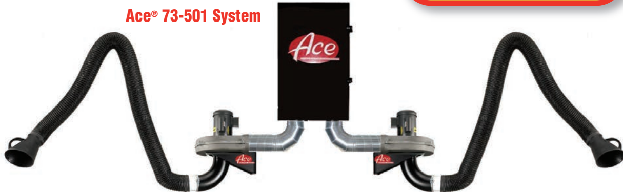
Ace® 73-501 System

*Extraction arms and exhausters sold separately. See facing page for more information.