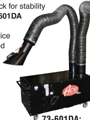
73-601DA: Dual arm model

Featuring 18 filtering combinations, including HEPA for Hexavalent Chromium control